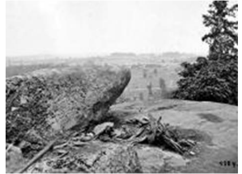
Little Round Top - Gettysburg

( http://about.usps.com/news/national-releases/2013/pr13_054.htm )