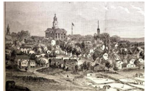
Vicksburg during the Civil War

( http://www.sonofthesouth.net/leefoundation/gettysburg-battle-pictures.htm )