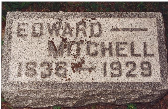
Oak Hill Cemetery, East Troy, WI