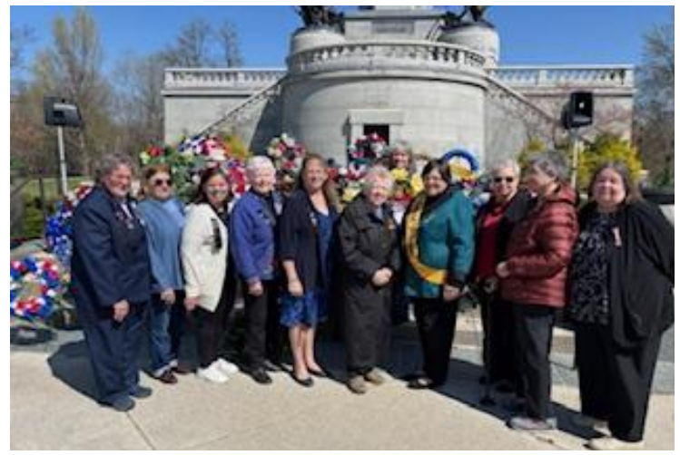
The above and below photos feature DUVCW members who were present at the 69 th Lincoln Tomb Ceremony from California, Illinois, Michigan, Ohio, New York, Washington, D.C. and Wisconsin.

The Kenosha Civil War Museum hosted an expo on March 22 nd . For the first time in several years, all of the Allied Orders participated in the event. Present were: SUVCW Camp 1, Auxiliary 4, the Woman's Relief Corps, Ladies of the Grand Army of the Republic and DUVCW Tent 23. Below are photos taken at the event.