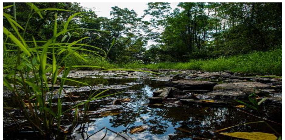
Photos to the left: Vicksburg National Military Park, MS, Shiloh Battlefield, TN, Fredericksburg, VA, Gettysburg, PA

A small donation on our part would assist the Trust in raising the needed funding. A generous benefactor has already donated half of the total needed.